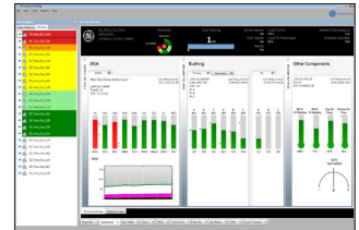
Transformer health/risk overview